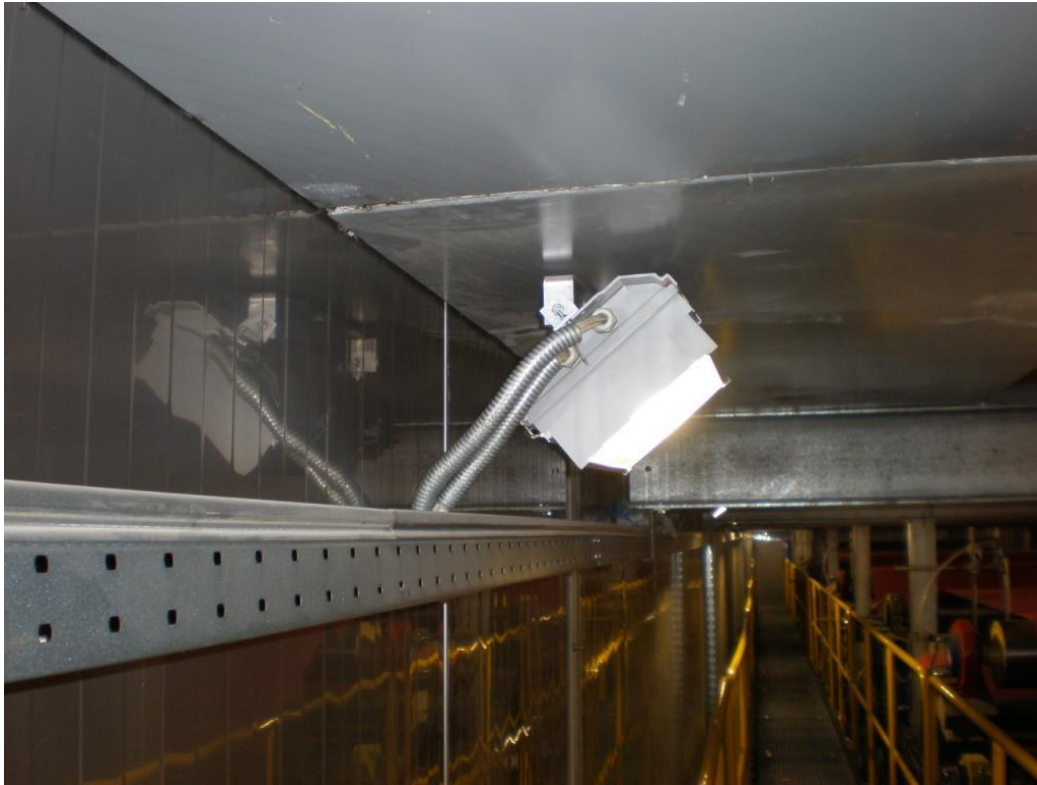
Hood interior; gable end under press section