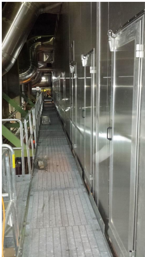
Drive side; access doors; exhaust air ducts