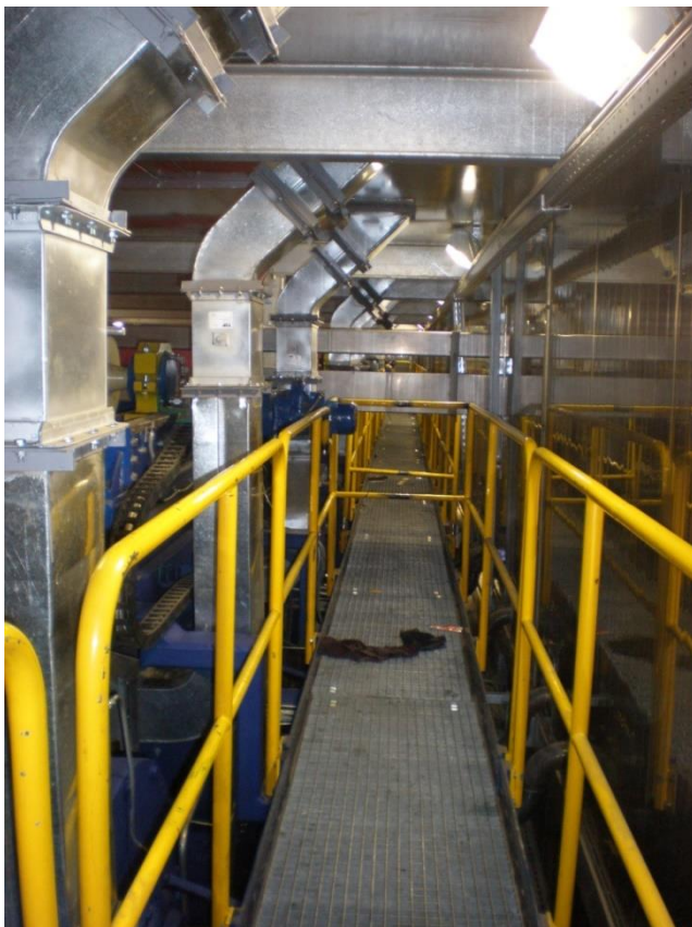
Hood interior; pocket ventilation feeding duct